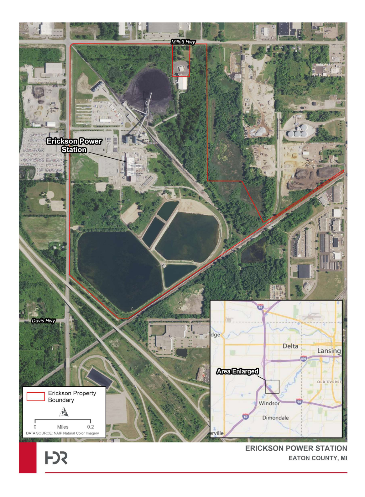
Figure 1. Vicinity Map for Erickson Power Station