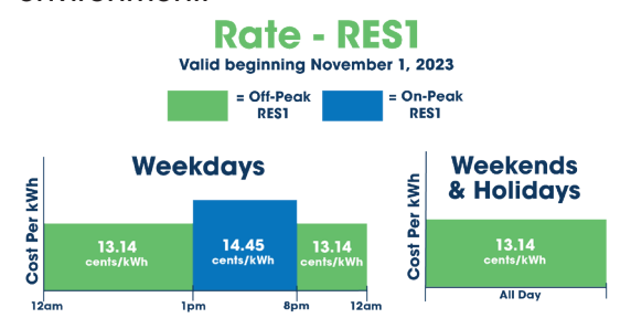
RES1 rates are the same in summer & winter.

The cost to generate energy is at its most expensive during peak demand, like on a hot summer day, and can put a strain on the power grid. On/Off-Peak hours allow you and the BWL to better manage costs and consumption, while also having a positive impact on the environment.